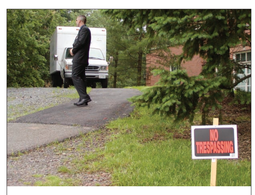
A U.S. federal security agent patrols the Marriott grounds.

I went down to the bar and began to chum around with the barkeep. "I hear they are kicking everyone out of the hotel on Thursday. What's the big event?" "I'm not allowed to talk about that," was his response. "So, what's the big event coming up this weekend?" I asked the front desk attendant. "Sorry, but we are not permitted to discuss that," she replied.